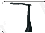
LED Desk Lamp