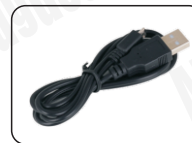
USB Power Cable