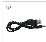
USB power cable