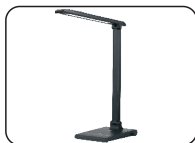
LED Desk Lamp